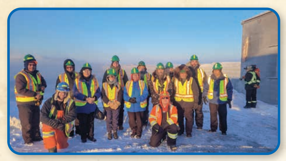
Tłįcho Government staff, Elders, and Burgundy staff during a site visit as part of Engagement with Burgundy Mine Ltd., January 2024.

We continue to work closely with Burgundy Diamonds to ensure the Ekati Mine is operated in a way that minimizes environmental and cultural impacts and allows for continuing employment and economic benefits.