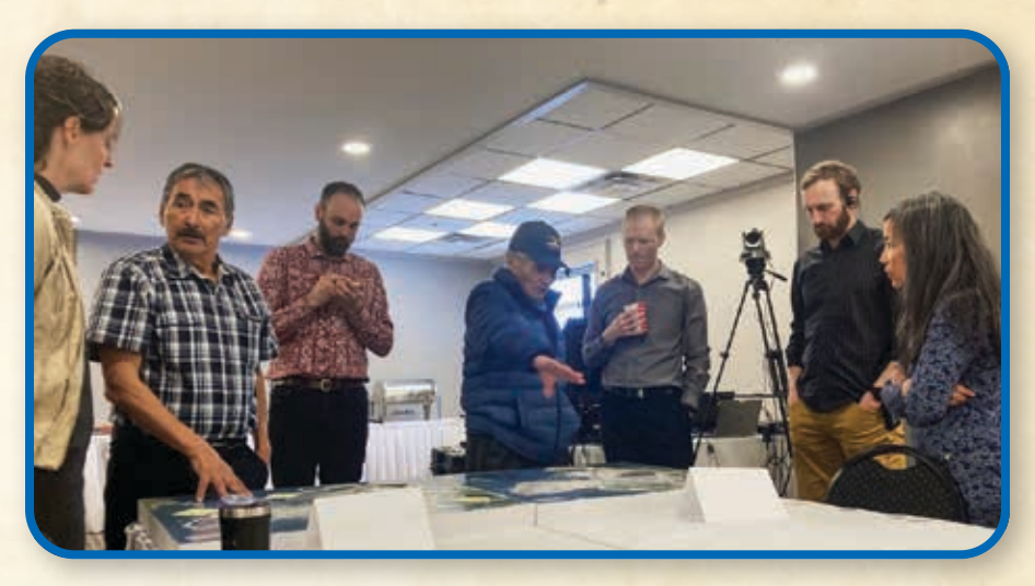
Tłįcho Government-organized Engagement Workshop with Diavik Diamond Mines Inc., April 2023, Yellowknife.

Active participation and engagement with Diavik in and out of the regulatory processes ensure that Tłıcho perspectives are communicated to the company directly and early enough to impact closure planning.