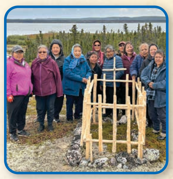
Wekweètì ladies, Winter Lake, August 11 to 21, 2023.

Community Presence Offices helped to maintain and clean gravesites and graveyards. The project educates youth about the proper way to fix ancestor cribs and provides Elders and youth with an opportunity to work together and share stories.