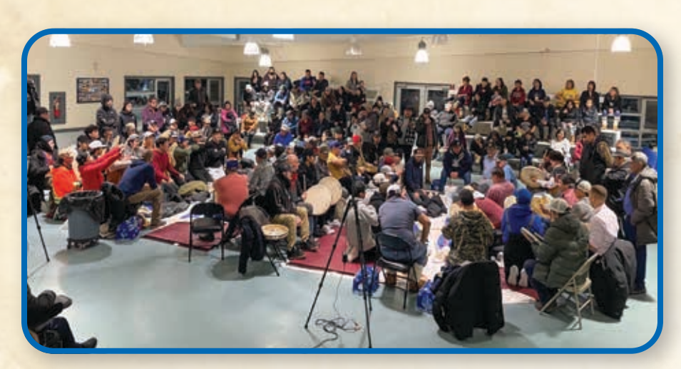
Whatì Hand Games Tournament, January 5 to 7, 2024.