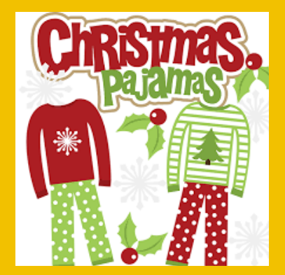
Family Night Tuesday, Nov.15 6-7:30 pm Christmas Pyjama Party Bring a food donation for the Christmas food drive.

Tuesday mornings at 11:15-12. Come by the library to read books, have free play with other families.