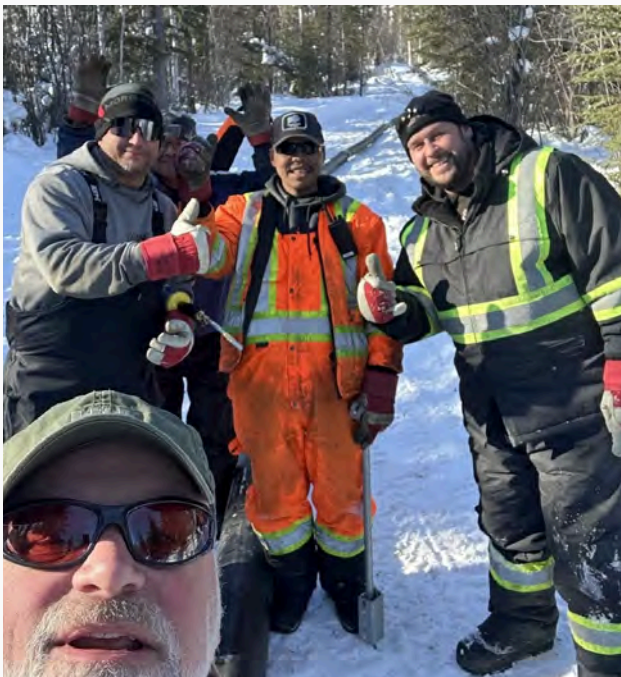
Workers installing water piping to Sherman Lake. March 24, 2024

In the winter of 2023, the Project Team built a winter road to Rayrock, set up a camp, brought in machinery and materials, and started the clean-up work in September. Between April and June 2024, the Project Team was busy clearing rock under the Mill, blasting and crushing the rock for the construction of the landfill and water treatment plant. Treatment of Mill Lake water will start in the Summer of 2024 and will continue on until freeze up.