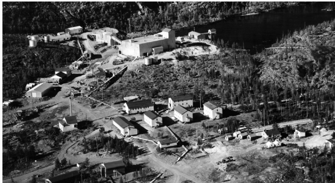
Rayrock Mine in 1958 with Mill Lake (Shìzì tì whetǫ)

See the Rayrock (Kwetı̄ᑦᑦ) Story Site for more information: https://shorturl.at/Q1vtd