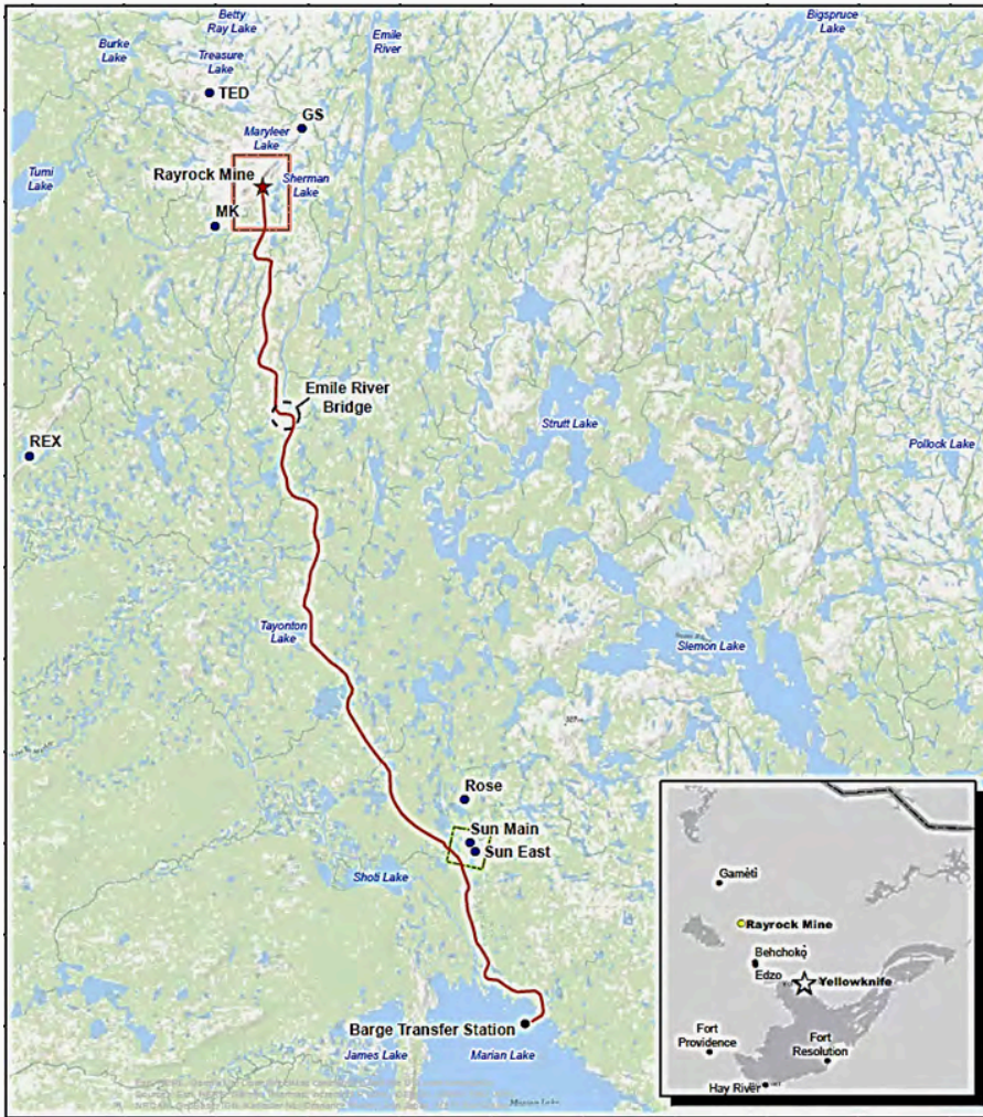
A map of the Kwetųᑭᑦᑲᑦ (Rayrock) Remediation Project sites.