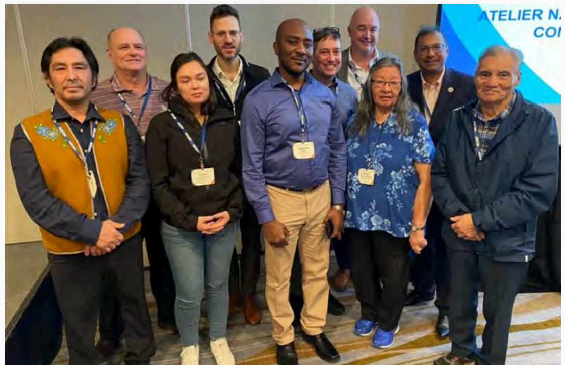
CIRNAC and Tłjchq Ndek'àowo at the November 2023 Federal Contaminated Sites Remediation Conference in Toronto.