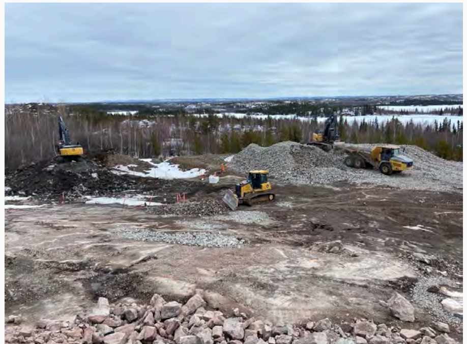
Image of the mine area: moving crushed rock to a new location. April 23, 2024